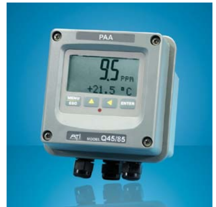
PAA Loop-Powered Transmitter