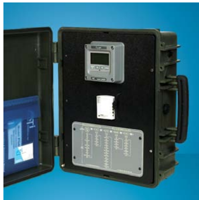
PQ45 Portable PAA Data Logger