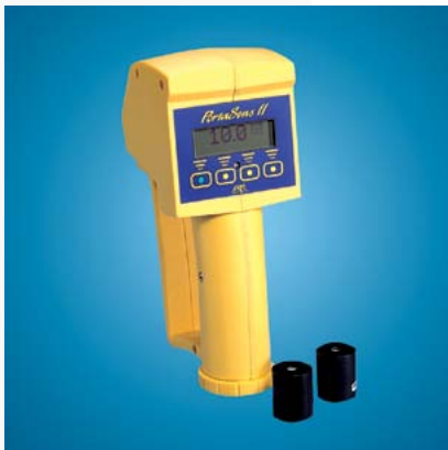
Toxic Gas Detector

ATI also offers a loop-powered dissolved peroxide monitor for those applications where extra outputs and/or relays are not required. A battery powered portable unit is also available with an internal data logger for temporary monitoring applications. And for safety around your peroxide system, ATI manufactures a variety of portable and fixed point gas detectors.