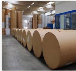
Pulp & Paper Mill