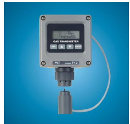
Fixed ClO 2 Gas Detector