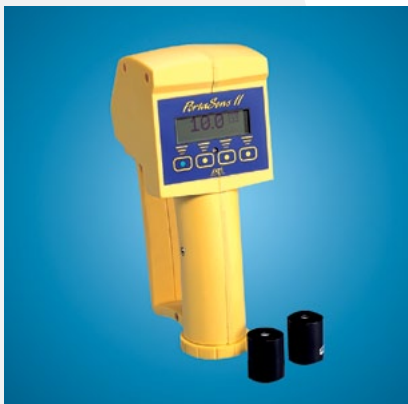
Portable ClO 2 Gas Detector

ATI also offers a loop-powered chlorine dioxide monitor for those applications where extra outputs and/or relays are not required. A battery powered portable unit is also available with an internal data logger for temporary monitoring applications. And for safety around your ClO 2 system, ATI manufactures a variety of portable and fixed point gas detectors.