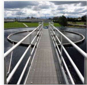
Potable Water Treatment