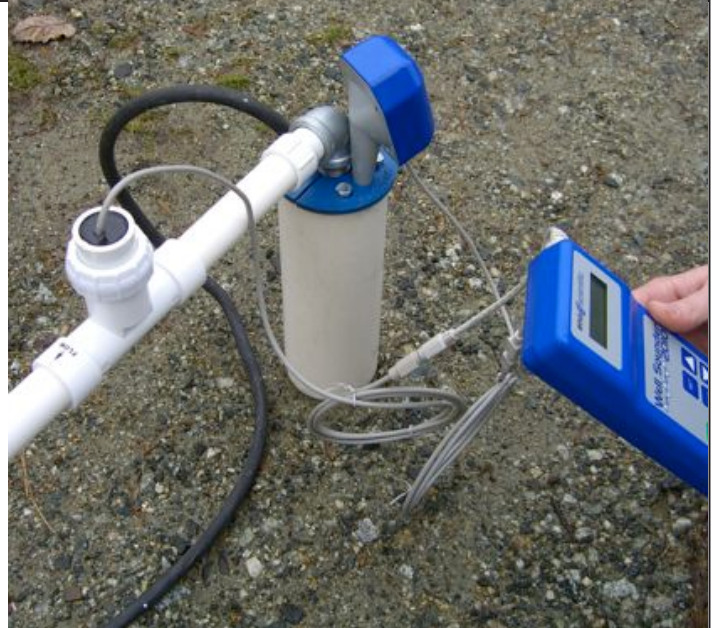
The flow meter shown in use with the Well Sounder 2010 PRO.

The electronic sensor operates off a 5-24VDC power supply and provides an output voltage on the signal line which switches between Vin and ground as the paddle wheel turns. The sensor is available in two configurations, with a plugged cable ready to plug into the Well Sounder, or with three wire leads for connection to other devices such as a logger. Note that external power is required in the 3 wire configuration.