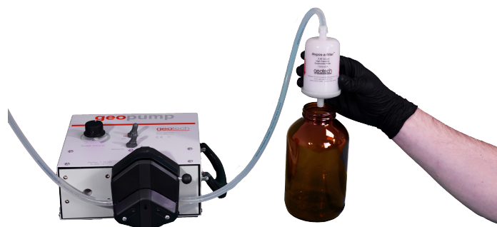
Sample collection with the Geopump™ Peristaltic Pump Series II with optional Geoload pump head (dispos-a-filter™ capsule sold separately)