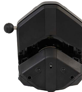
Geoload Pump Head

Optional Short Shaft for stacking pump heads. Additional hardware required.