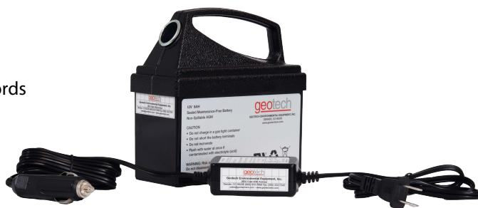
Geopump™ 12V Portable Battery and Charger