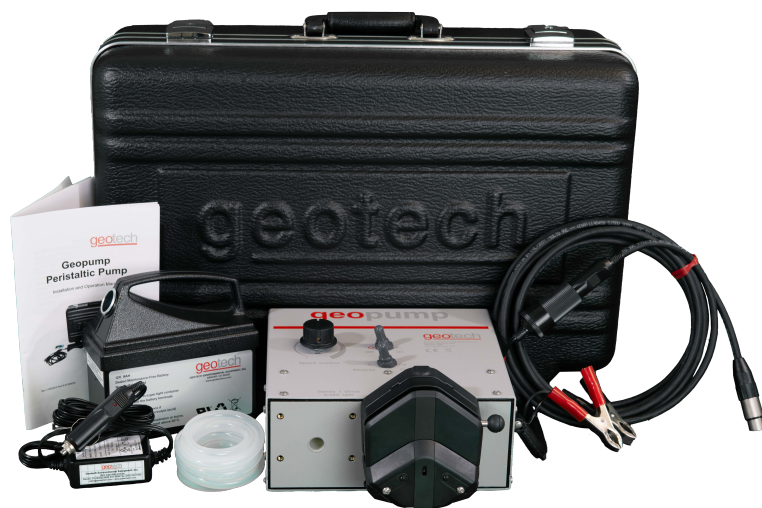
Geopump™ Peristaltic Pump Series II Kit with optional Geoload pump head, modular battery, 5 ft. (1.5 m) tubing, carrying case and power cord

SERIES II Geopump™ Peristaltic Pumps are available in AC only, DC only, or AC/DC combination. They have two pumping stations which can also be piggy-backed for multi-station pumping. The first pumping station has a variable speed of 30 to 300 RPM and the second station 60 to 600 RPM.