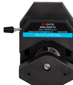
Easy-load® II Pump Head