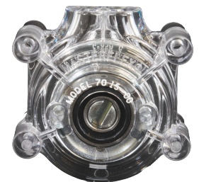
Standard Pump Head