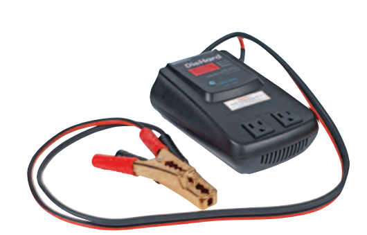
Optional DC to AC Inverter