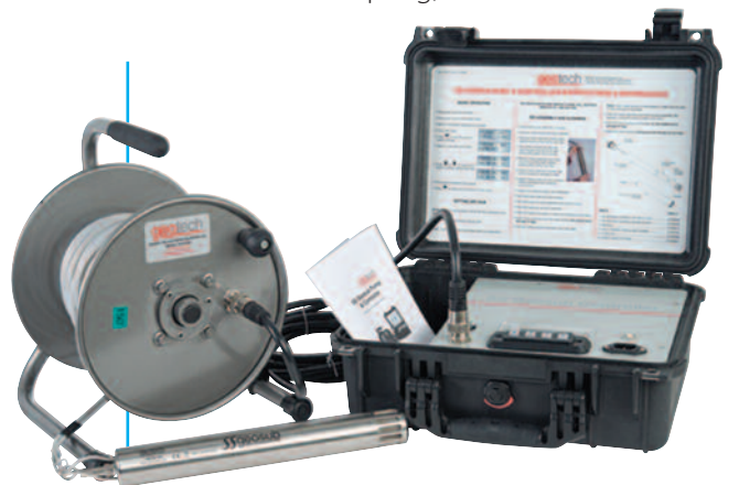
Geotech SS Geosub & Controller