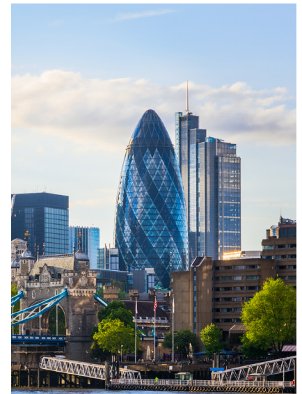
MaxiMet compact weather stations are integrated into systems monitoring gas and particulate concentrations in the air.