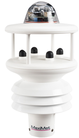
MaxiMet GMX600 measures 6 parameters including precipitation.