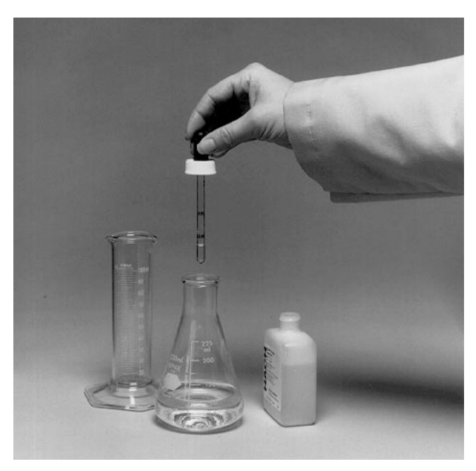
3. Measure a sample into a clean erlenmeyer flask and add buffers and/or indicators as required.

2. Remove the cap from the cartridge and install a delivery tube. Use a straight delivery tube for hand-held titrations or a 90° delivery tube for titrations using a laboratory stand to hold the titrator. Turn the delivery knob to flush the delivery tube with titrant and reset the counter to zero.