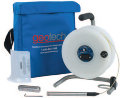
Geotech ET with optional bag and tape weight