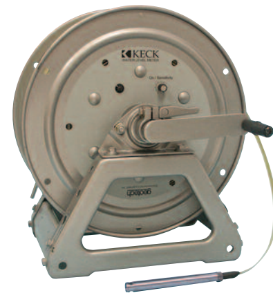
1500' Water Level Meter (manual rewind)