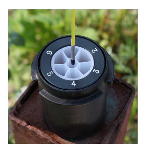
Measure water levels within the narrow channels of a Solinst CMT<sup>®</sup> System.

The 102M Mini Water Level Meter is available in 25 m and 80 ft lengths. There is the choice of the P4 or P10 Probe.