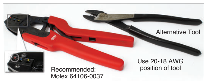
Molex Crimp Tool Options (20-18 AWG)