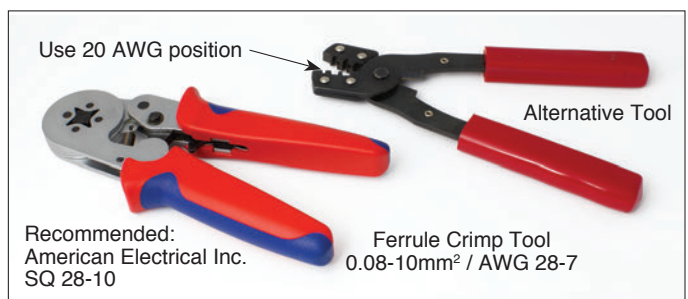
Ferrule Crimp Tool Options (20 AWG)