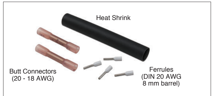
Tape Splice Kit (#110277)