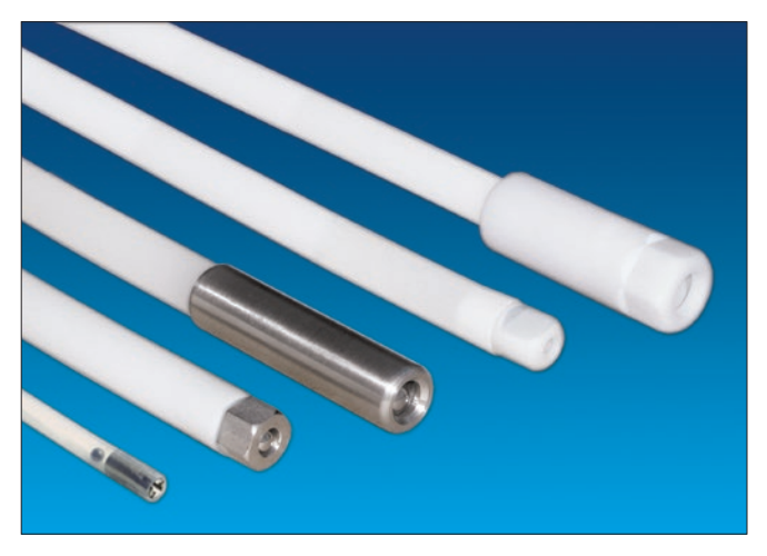
From left to right: Mini Inertial Pump, SS16, SS19, D16, and D25 Inertial Pumps