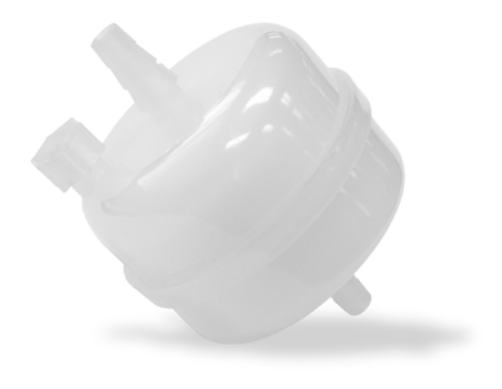
Model 860 Disposable Filter

These filters can also be used with most other Solinst sampling devices. (See Solinst Model 860 Data Sheet.)