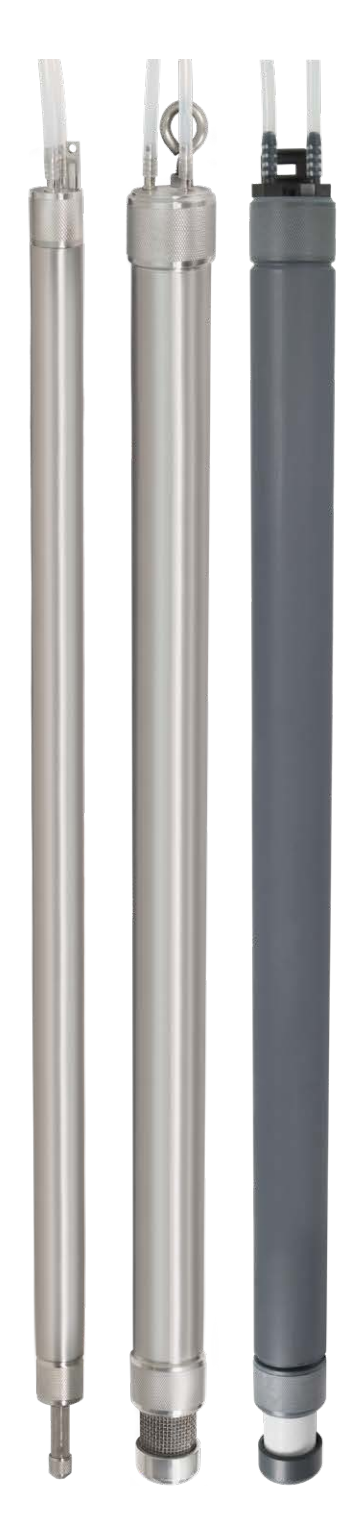
Solinst Bladder Pumps available in Stainless Steel 1" and 1.66" (25 mm and 42 mm) and PVC 1.66" (42 mm)

Portable Bladder Pumps are supplied on a free-standing reel. The rugged systems are very convenient and easy to transport. The barb and compression tubing fittings on the reels and controller allow quick set-up in the field. Use a Solinst Model 103 Tag Line to lower and support the pump in the well (see Model 103 Data Sheet).