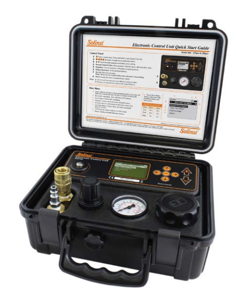
Model 464 Electronic Control Unit (125 psi and 250 psi Models)

An advantage of the Bladder Pump is the ability to also use it without a bladder. This allows you to continue sampling if you are in the field with no bladder replacements. Simply operate it like a Double Valve Pump (DVP).