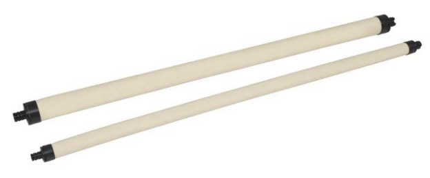
Replaceable Bladder Cartridges

The compressor uses a 12-volt DC power source, such as a car or truck battery, and comes with alligator clips. It operates at up to 150 psi and is equipped with a 2 US gallon (7.6 L) air tank rated to 175 psi.