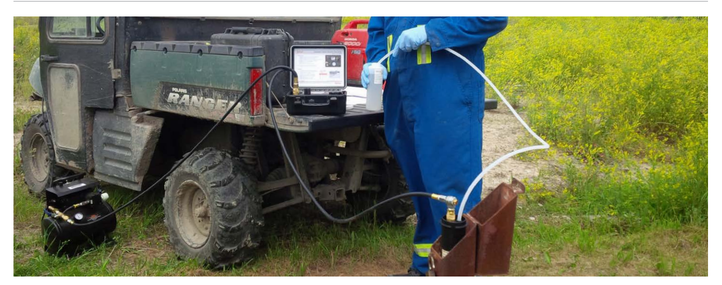
Groundwater Sampling with a Dedicated Bladder Pump using Portable, Rugged, Easy-to-use, Compressor and Controller

Dedicated well caps slip easily onto 2" dia. (50 mm) wells. Adaptors to fit 4" dia. (100 mm) wells are also available. They have quick-connect fittings for the drive and sample tubing.