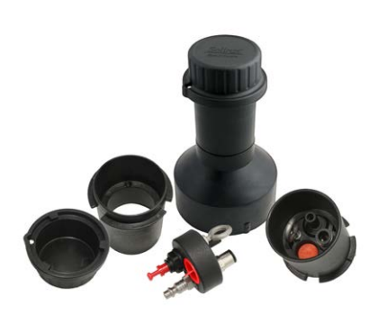
Well Caps for Dedicated Bladder Pumps