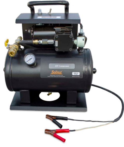
12 Volt Compressor

These convenient Controllers are rugged, dependable, and suitable for all environments. Quick-connect fittings allow instant attachment to dedicated well caps, portable reel units, and an air compressor or compressed gas source.