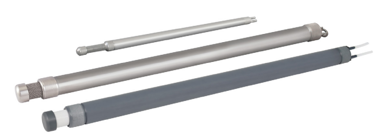
1.66" (42 mm) and 5/8" (16 mm) dia. Stainless Steel and 1.66" dia. PVC Double Valve Pumps