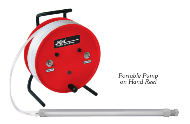
®Solinst is a registered trademark of Solinst Canada Ltd.

For less frequent sampling, reel mounted portable systems allow access to multiple monitoring wells, even in remote locations. The reel mounted portable units are free-standing with a convenient carrying handle. They can be made for almost any size or depth of application.