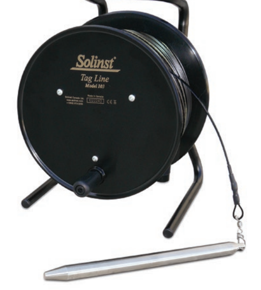
Tag Line / Suspension Cable