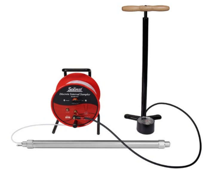
1.66"ø Discrete Interval Sampler with High Pressure Hand Pump