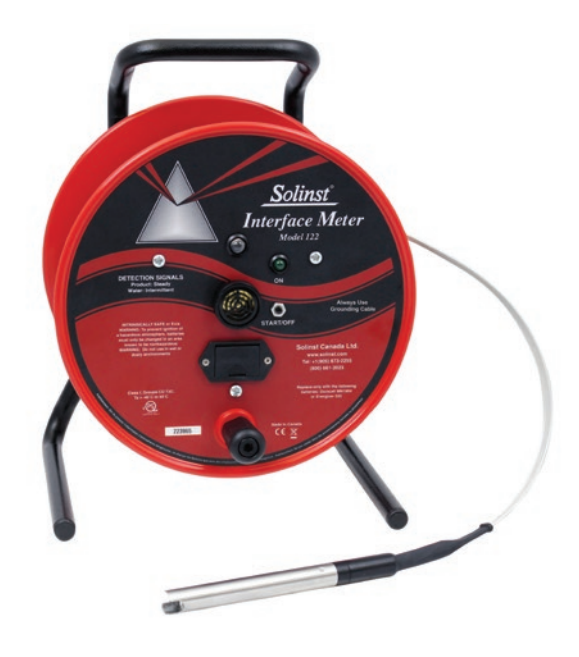
Oil/Water Interface Meter