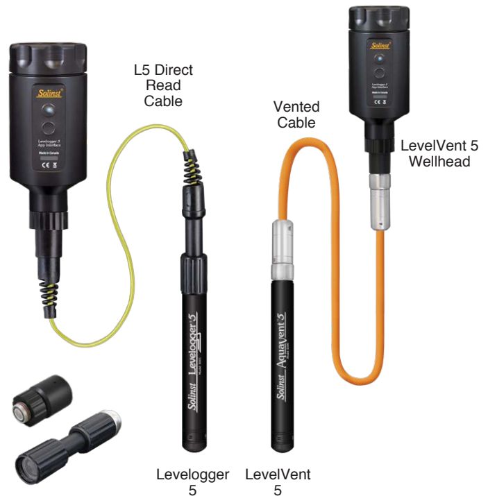
L5 Threaded and Slip Fit Adaptors allow you to directly connect your Levellogger to the Levellogger 5 App Interface.