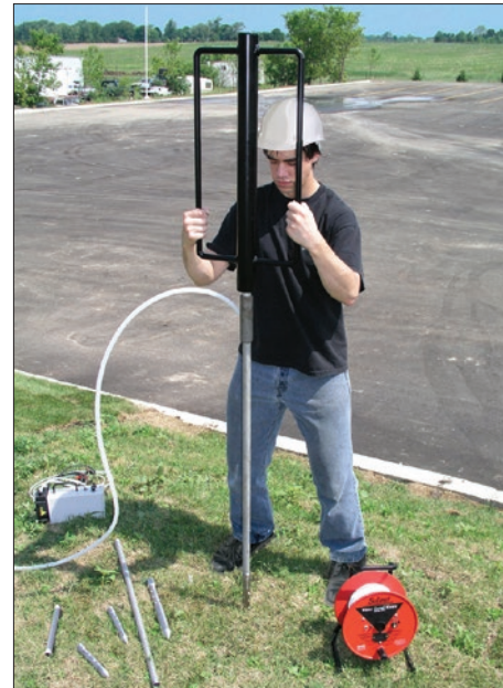
Installing Piezometers with a Manual Slide Hammer

Solinst Drive-Point Piezometers can be driven into the ground with any direct push or drilling technology, including the Manual Slide Hammer shown at right. To avoid clogging or smearing of the screen during installation, a shielded version is also available.