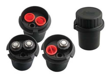
Levelogger 2" Locking Well Cap Installations (see Well Caps data sheet for more details)

The cap is vented to equalize atmospheric pressure in the well. It slips over the casing, and can be secured using a lock with a 9.5 mm (3/8") shackle diameter.