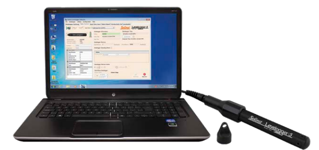
Fast communication and downloading speeds with a high speed Field Reader 5