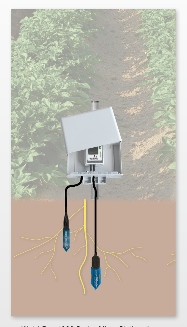
WatchDog 1000 Series Micro Station shown with one WaterScout SM 100 Sensor and one SMEC 300 sensor.