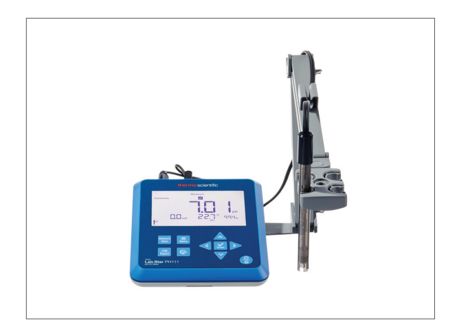
Each meter comes with a stand that helps facilitate electrode movement into and out of samples.