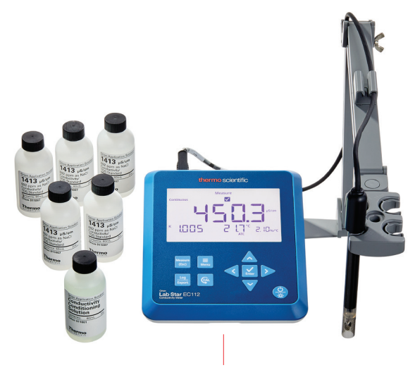
For a wide variety of conductivity samples in the 1 µS/cm to 20 mS/cm range.