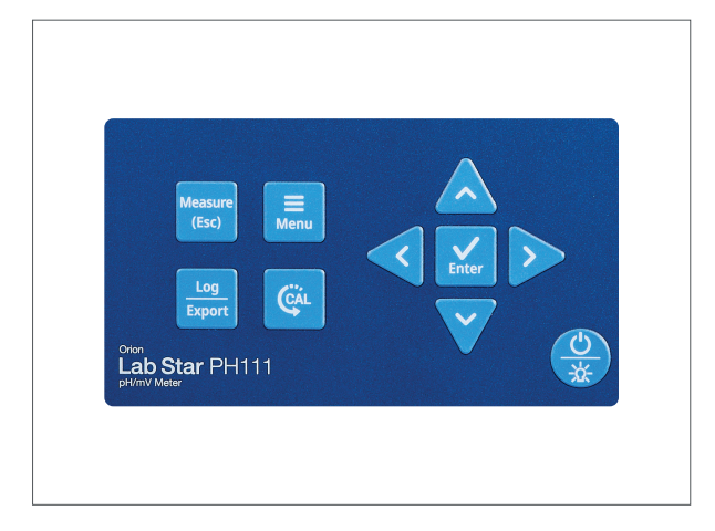
Keypad is designed with buttons for durability in the lab and easy wipe down or disinfection.