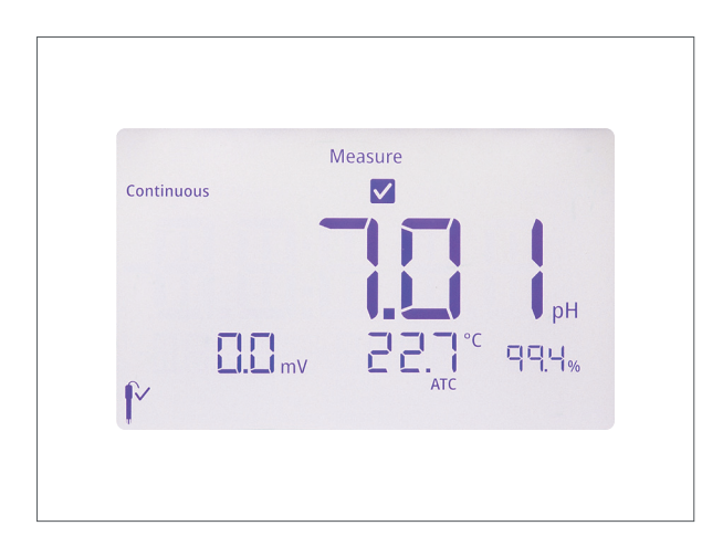
On-screen icons indicate measurement stability statuses, giving you greater confidence in your readings.