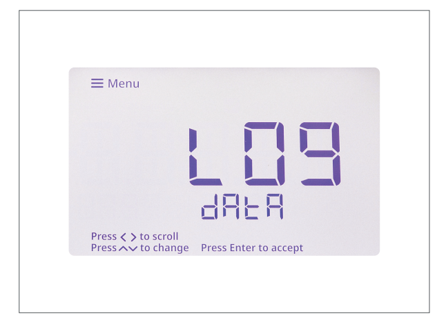
Critical data is automatically saved to the meter's 500-point data log.