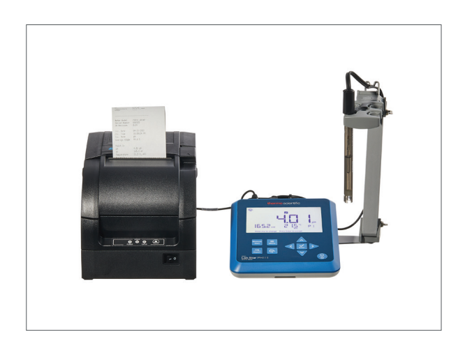
Data logs and calibration logs can be exported via the communication port to a computer or printer.