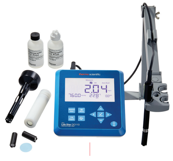
For a wide variety of dissolved oxygen samples plus BOD with an included adapter.