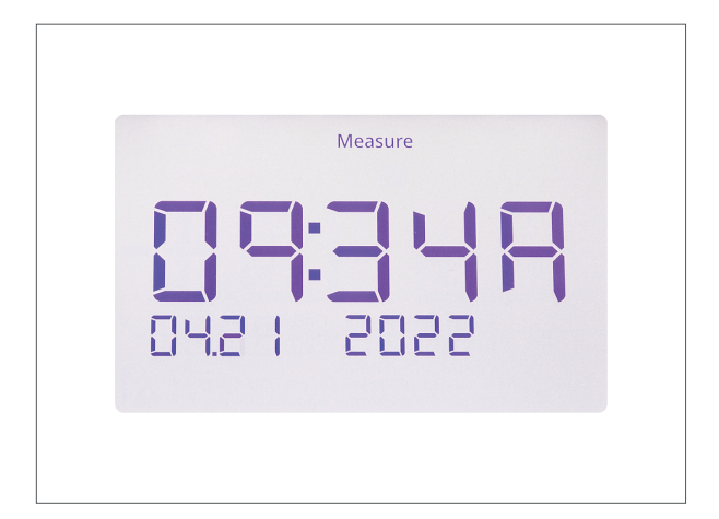
All data logs and calibration logs are date and time stamped for GLP/GMP reporting.