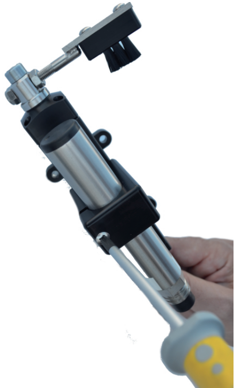
Horizontal Brush - Adjust clamp