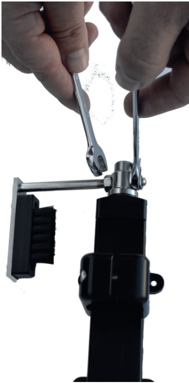
Vertical Brush - Adjust arm

The brush pressure can easily be adjusted by sliding the sensor upwards or downwards in the clamp. Do this by loosening the clamp screw and tightening again once you have made the desired adjustment.